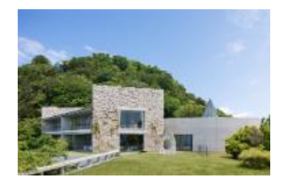
Benesse House Museum