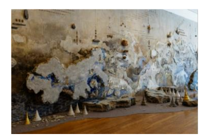
Pannaphan Yodmanee 《Aftermath》 2016