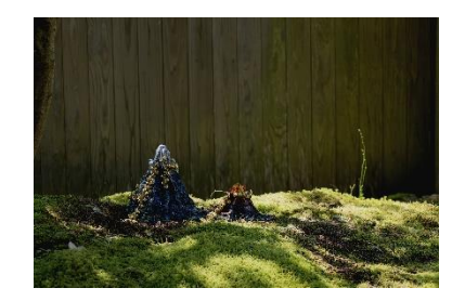
Ring of Fire - Solar Yang & Lunar Weerasethakul, Solar (Day) Outdoor Exhibits